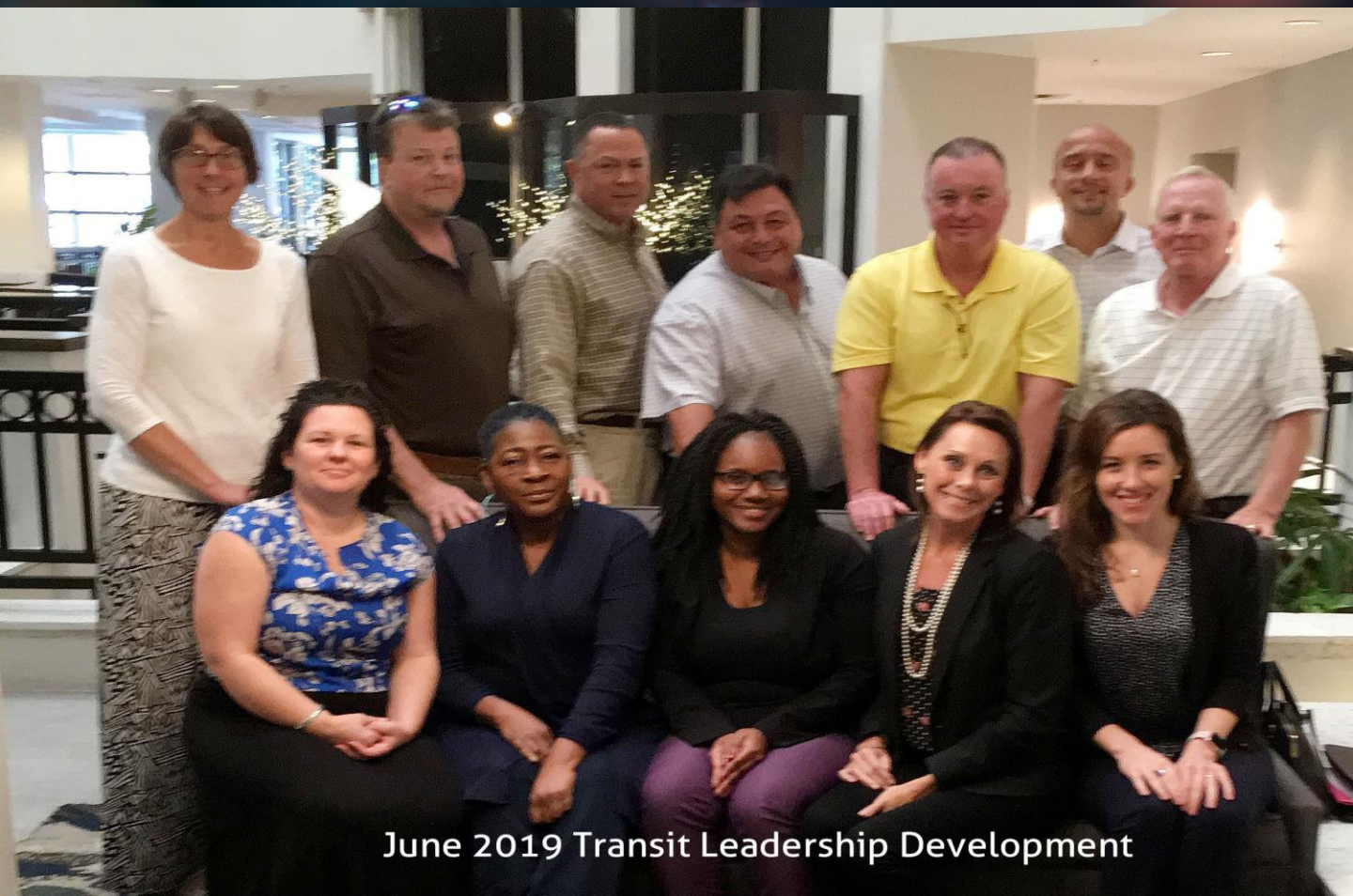
June 2019 Transit Leadership Development