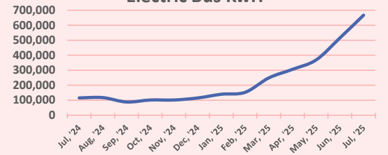
Electric Bus Kwh